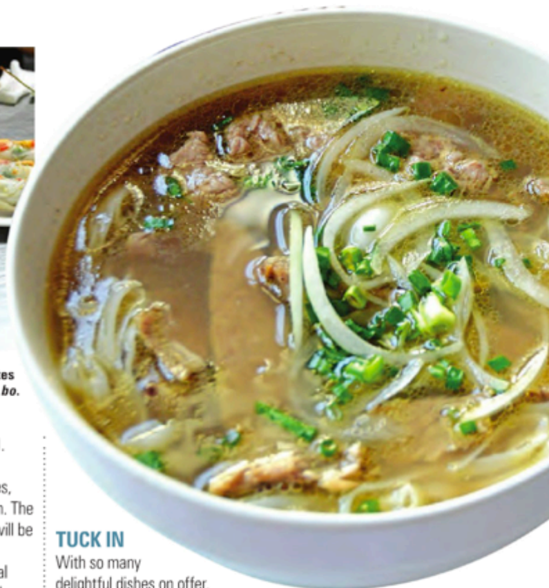
A taste of Vietnam ... (from left) bun cha gio , plates of street food, the famous pho bo .